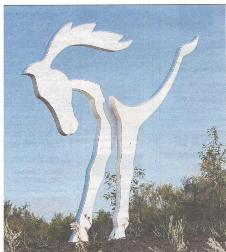
Bletchley Park's ties to local equestrian facilities are reflected in public art.