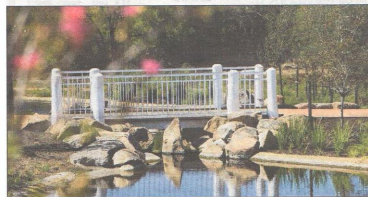
There is a network of walk trails through Bletchley Park.